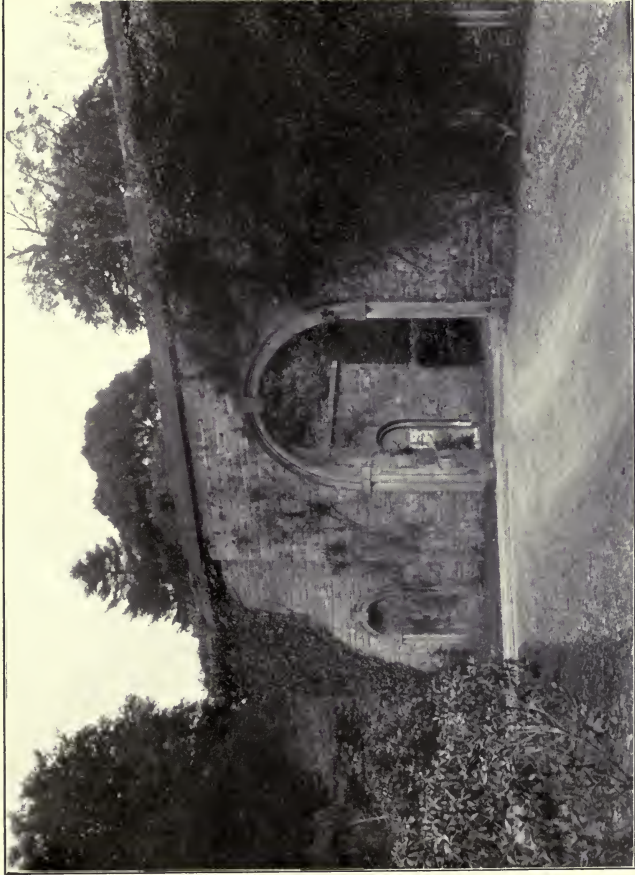
THE OLD GATEWAY AT GOSFORD CASTLE